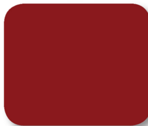
Tile Red PMS:484C