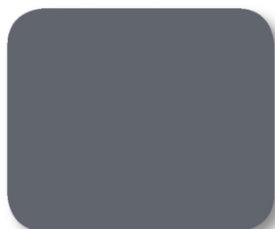
Charcoal PMS:Cool Gray 10C