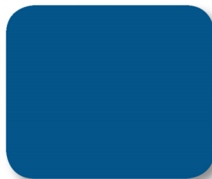
Regal Blue* PMS:286C

NOTE: DiamondStone® color comparisons to PMS numbered swatches are for reference only and are subject to slight variations in color.