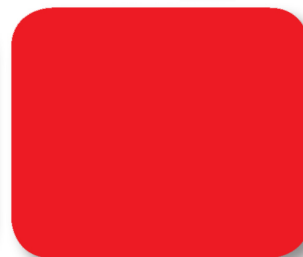
Safety Red* PMS:199C