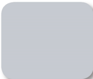
Light Gray PMS:434C