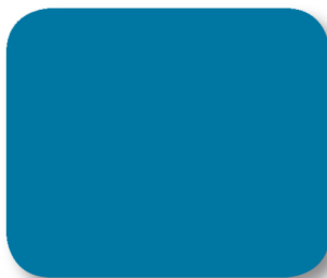
Ocean Blue* PMS:7704C